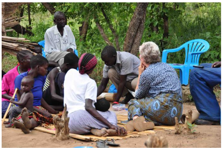
Listening to the story of the Apyeta North Family Support Group

In order to learn more about how these particular community-based structures had been set up, we met with members of two Family Support Groups. As we introduced ourselves and explained why we were there we drew a simple picture of each member of the group – identifying them by their clothing. Then we asked, " What steps did you follow to make this group? "