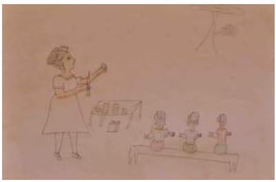
"I want to be a nurse and help mothers with new babies"