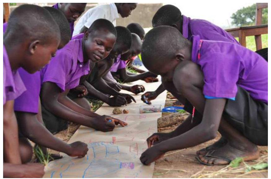
Children draw their village

When collecting information for this case study we also spoke to children from both Apyeta North and South in their local school. As part of the learning, the children were asked to draw their villages on a large map and identify where children sometimes have problems. This extract from a discussion shows that the children know the Family Support Groups and also tells the story of how a group intervened in a child's life.