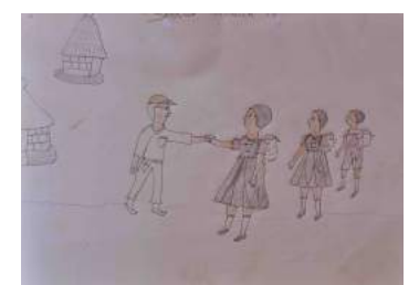
"If my father says I must marry a man and have to stop school that will stop me."

Both pictures are by Girl, 13, Apyeta South (this girl's story is told on page 12).